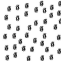
b) masked display

There were six masking conditions which differed in terms of the exposure duration : 33 ms vs. 50 ms vs. 67 ms vs. 83 ms vs. 100 ms vs. 117 ms.